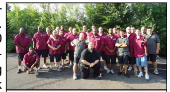
The Lazarus Guys