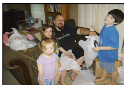
Assembling care packages