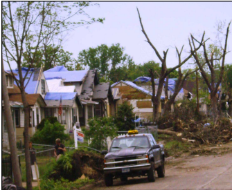
An area of North Minneapolis after the storm

Well all that abruptly ended on May 22nd, when a tornado touched down in north Minneapolis leaving damage and devastation in its wake. In an instant one hundred year old trees snapped like toothpicks, roofs were torn off buildings, windows were sucked out of homes, cars were crushed and people