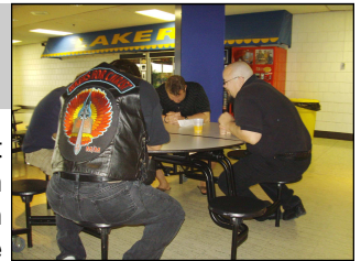
Coming to the Lord in prayer.

Lake, MN. It was a great blessing for us to join with this body of believers in worship and prayer. He preached from Psalm 1 about "The Blessed Man" and encouraged and exhorted everyone present to the importance of memorizing and meditating on God's Word.